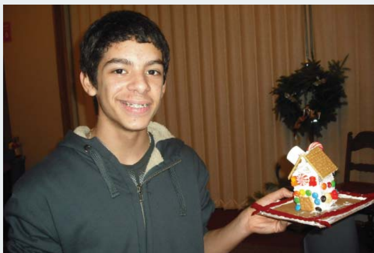
Fun at FOA's Echo Village December Holiday Party.

Everyone wins and FOA can't thank all of you enough!