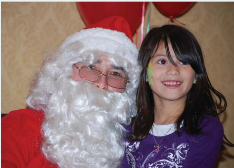
Members of the Rotary Club of Amherst join clients and staff of Family Outreach of Amherst at the Courtyard by Marriot in Hadley in December of its annual Holiday Giving Party.