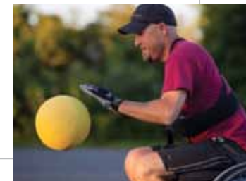
Members of the Disability Resource Program competing in a wheelchair soccer match.