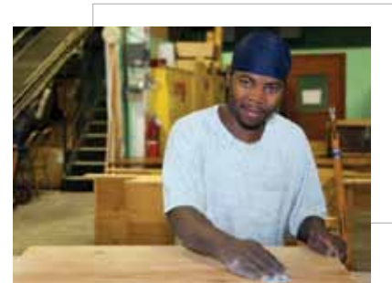
At Riverbend Furniture in Springfield, a staff person prepares a piece of wood that will become a table.

Our largest program in this area is the Disability Resource Program. It helps people with physical disabilities or visual impairments build their self-confidence, interactive skills, and physical abilities with organized activities, support groups, and self-advocacy. Last year's 132 barrier-free recreational activities—wheelchair basketball, soccer, hockey, cycling, golf, swimming, and more—drew well over 1,000 participants. We also seek to educate the public about disability issues, and in FY09 we organized 41 speaking engagements that reached more than 3,000 people.