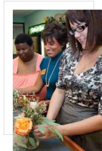
Staff at A New Leaf flower shop in Holyoke create flower arrangements for a special occasion.

Last year's state budget cuts unfortunately targeted these services. However, we were able to maintain all three of our programs with some assistance from shared company resources and a reorganization at Riverbend, which builds furniture. It was fortunate—not to mention impressive—that Riverbend last year achieved its operating goal of breaking even, with record sales approaching $2 million. The high quality of the products produced in its Springfield site has resulted in contracts to build furniture for public and private organizations throughout New England.