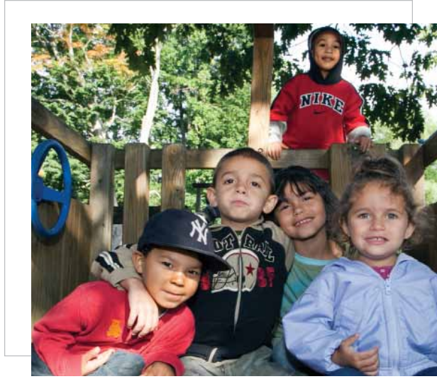
At Jessie's House family shelter in Amherst, children play in the backyard tree house.

CHD is among the largest employers in western Massachusetts, with more than 1,100 human service professionals.