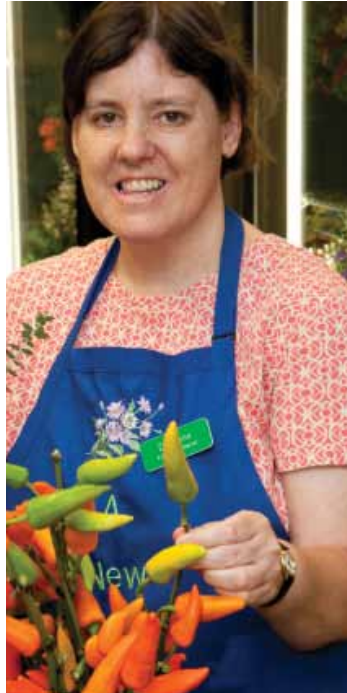
A New Leaf provides meaningful and creative employment for persons with disabilities.