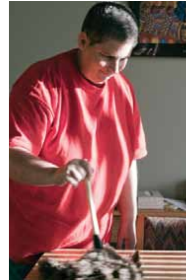
From left to right: Staff person at A New Leaf flower shop makes jewelry that is sold at the shop. Advance Office Cleaning staffer dusts a business client's office.